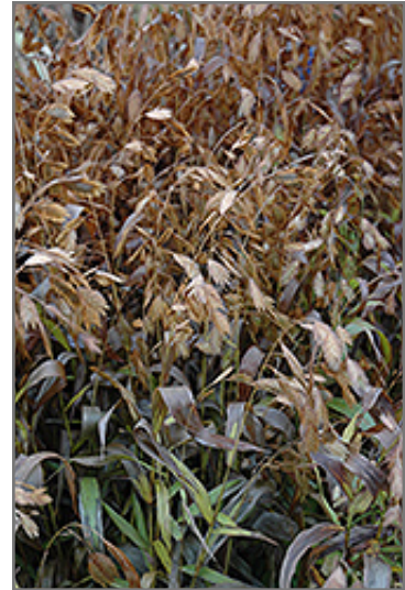
Northern Sea Oats in fall

Northern Sea Oats is recommended for the following landscape applications;