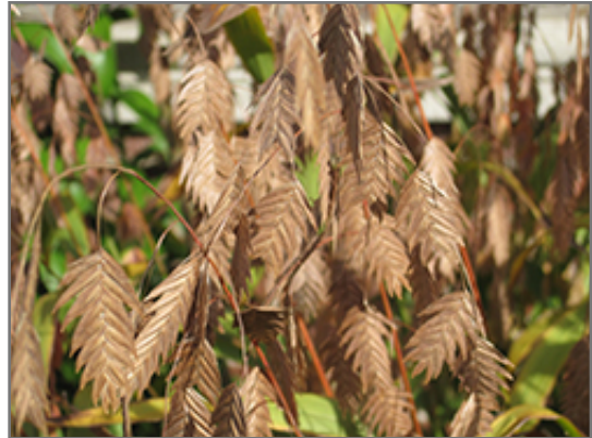
Northern Sea Oats fruit

Northern Sea Oats will grow to be about 4 feet tall at maturity, with a spread of 30 inches. Its foliage tends to remain dense right to the ground, not requiring facer plants in front. It grows at a medium rate, and under ideal conditions can be expected to live for approximately 10 years. As an herbaceous perennial, this plant will usually die back to the crown each winter, and will regrow from the base each spring. Be careful not to disturb the crown in late winter when it may not be readily seen!