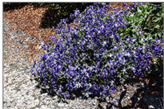
Sapphire Indigo Clematis in bloom