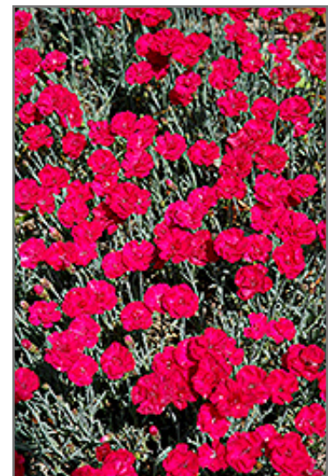
Frosty Fire Pinks flowers