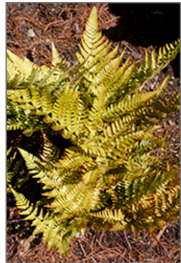
Brilliance Autumn Fern in fall