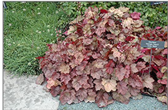
Georgia Peach Coral Bells

Georgia Peach Coral Bells is recommended for the following landscape applications;