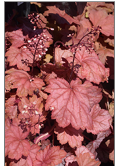
Georgia Peach Coral Bells in bloom