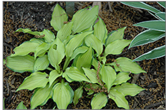
Cracker Crumbs Hosta

Cracker Crumbs Hosta is recommended for the following landscape applications;