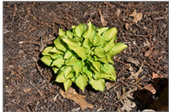
Cracker Crumbs Hosta

Cracker Crumbs Hosta is recommended for the following landscape applications;