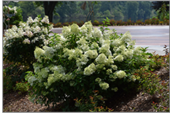
Little Lime Hydrangea in bloom

This shrub performs well in both full sun and full shade. It prefers to grow in average to moist conditions, and shouldn't be allowed to dry out. It is not particular as to soil type or pH. It is highly tolerant of urban pollution and will even thrive in inner city environments. Consider applying a thick mulch around the root zone in winter to protect it in exposed locations or colder microclimates. This is a selected variety of a species not originally from North America.