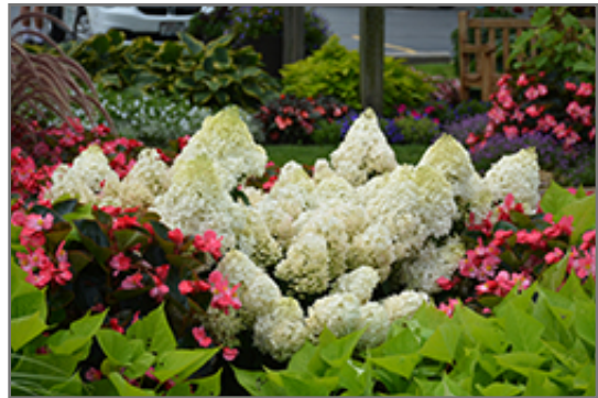
Little Lime Hydrangea flowers