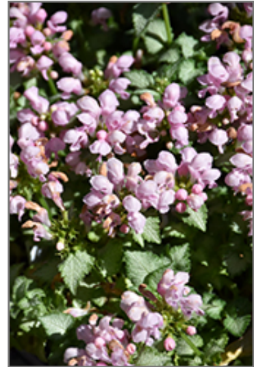
Pink Pewter Spotted Dead Nettle flowers

Pink Pewter Spotted Dead Nettle is recommended for the following landscape applications;