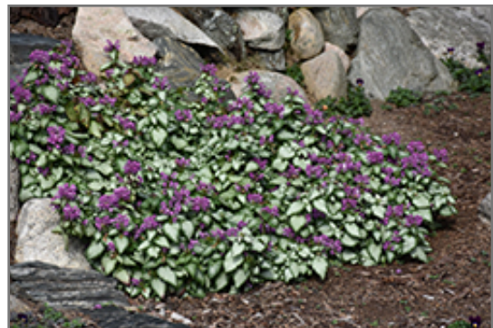
Purple Dragon Spotted Dead Nettle in bloom