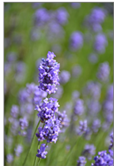
Hidcote Blue Lavender flowers