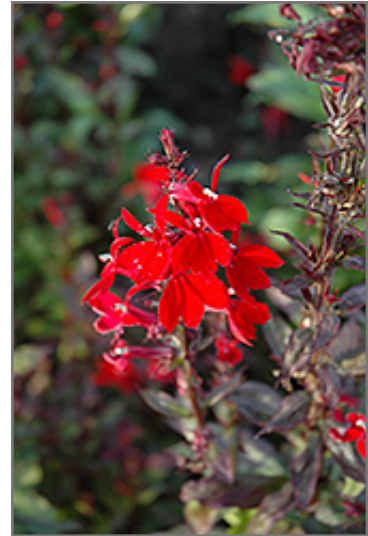
Queen Victoria Lobelia flowers