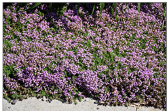
Elfin Creeping Thyme in bloom