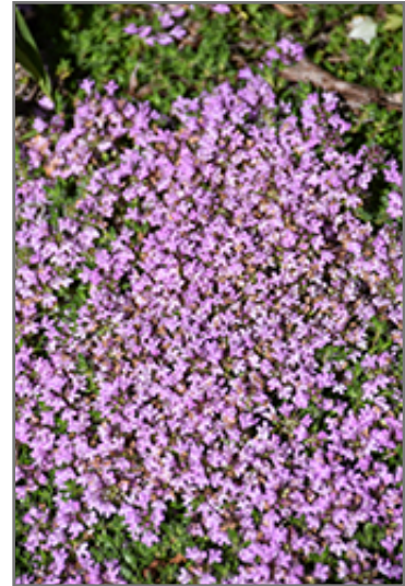
Elfin Creeping Thyme flowers

This plant will require occasional maintenance and upkeep, and is best cleaned up in early spring before it resumes active growth for the season. Deer don't particularly care for this plant and will usually leave it alone in favor of tastier treats. Gardeners should be aware of the following characteristic(s) that may warrant special consideration;