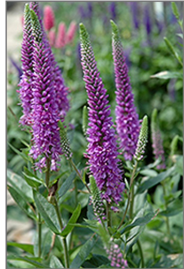
Purpleicious Speedwell flowers