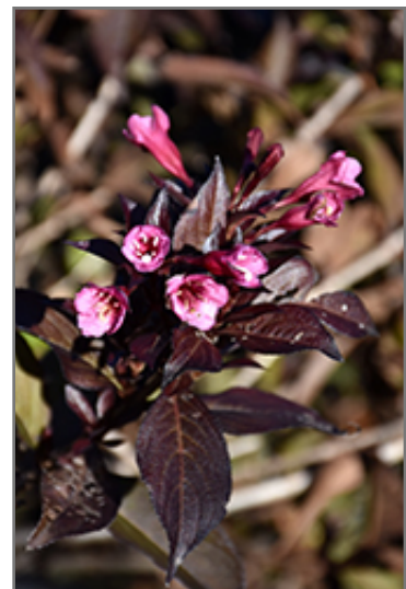
Fine Wine Weigela flowers