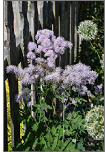
Meadow Rue flowers

Meadow Rue is recommended for the following landscape applications;