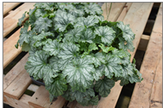
Paris Coral Bells foliage