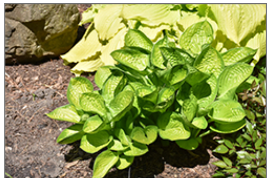
Rainforest Sunrise Hosta