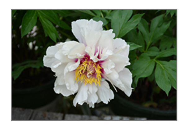
Cora Louise Peony flowers