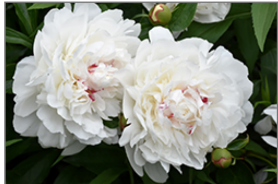
Festiva Maxima Peony flowers

Festiva Maxima Peony is recommended for the following landscape applications;