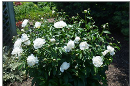
Festiva Maxima Peony in bloom