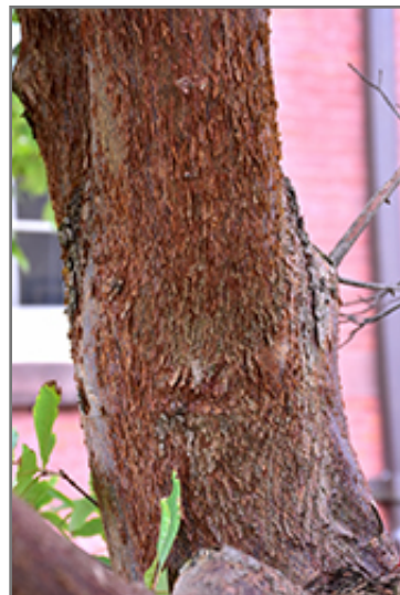
Gingerbread Paperbark Maple bark

This tree does best in full sun to partial shade. It prefers to grow in average to moist conditions, and shouldn't be allowed to dry out. It is not particular as to soil type or pH. It is somewhat tolerant of urban pollution. This particular variety is an interspecific hybrid.