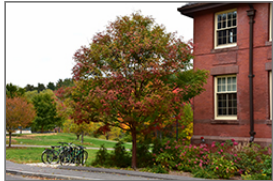
Gingerbread Paperbark Maple in fall