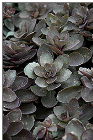
Dazzleberry Stonecrop foliage