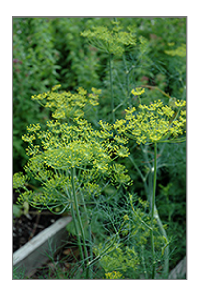
Dill flowers