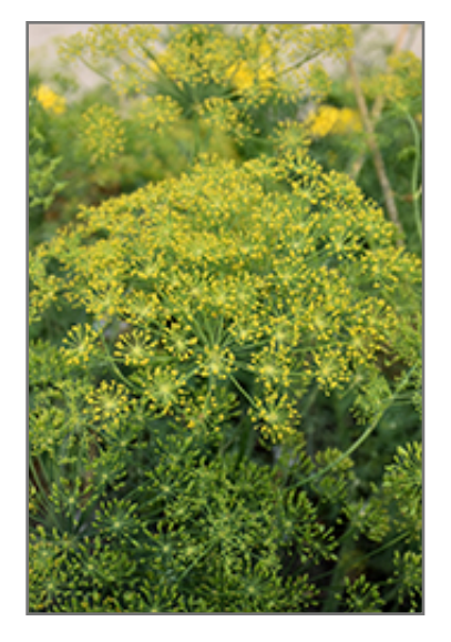
Dill flowers

This plant is typically grown in a designated herb garden. It should only be grown in full sunlight. It does best in average to evenly moist conditions, but will not tolerate standing water. It is not particular as to soil pH, but grows best in rich soils. It is somewhat tolerant of urban pollution. This species is not originally from North America.