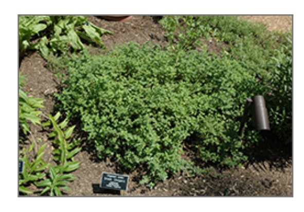
Greek Oregano

Greek Oregano will grow to be about 16 inches tall at maturity extending to 24 inches tall with the flowers, with a spread of 14 inches. When grown in masses or used as a bedding plant, individual plants should be spaced approximately 12 inches apart. Its foliage tends to remain dense right to the ground, not requiring facer plants in front. Although it's not a true annual, this fast-growing plant can be expected to behave as an annual in our climate if left outdoors over the winter, usually needing replacement the following year. As such, gardeners should take into consideration that it will perform differently than it would in its native habitat.