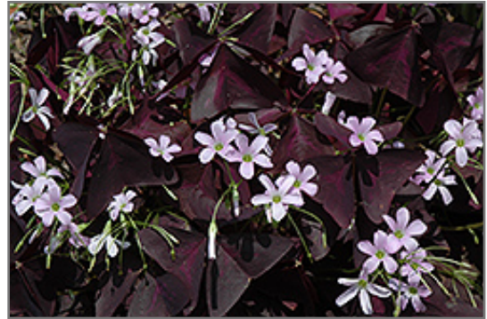
Purple Shamrock flowers

When grown indoors, Purple Shamrock can be expected to grow to be only 6 inches tall at maturity extending to 8 inches tall with the flowers, with a spread of 6 inches. It grows at a medium rate, and under ideal conditions can be expected to live for approximately 10 years. This houseplant will do well in a location that gets either direct or indirect sunlight, although it will usually require a more brightly-lit environment than what artificial indoor lighting alone can provide. It is very adaptable to both dry and moist soil, but will not tolerate any standing water. The surface of the soil shouldn't be allowed to dry out completely, and so you should expect to water this plant once and possibly even twice each week. Be aware that your particular watering schedule may vary depending on its location in the room, the pot size, plant size and other conditions; if in doubt, ask one of our experts in the store for advice. It is not particular as to soil type or pH; an average potting soil should work just fine.