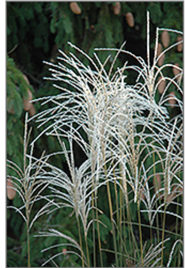
Graziella Maiden Grass fruit