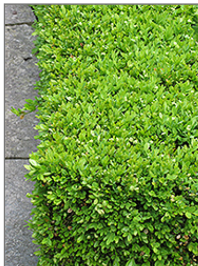
Green Velvet Boxwood foliage