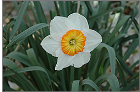
Professor Einstein Daffodil flowers