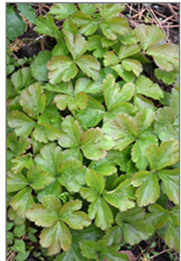
Barren Strawberry