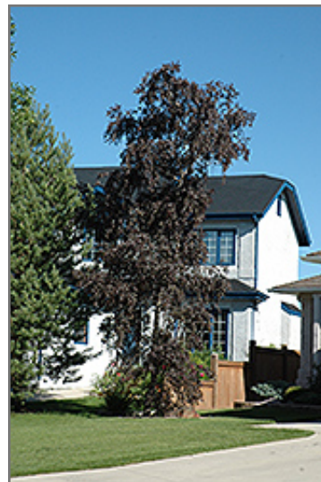
Royal Frost Birch

Royal Frost Birch will grow to be about 40 feet tall at maturity, with a spread of 25 feet. It has a low canopy with a typical clearance of 3 feet from the ground, and should not be planted underneath power lines. It grows at a fast rate, and under ideal conditions can be expected to live for 40 years or more.