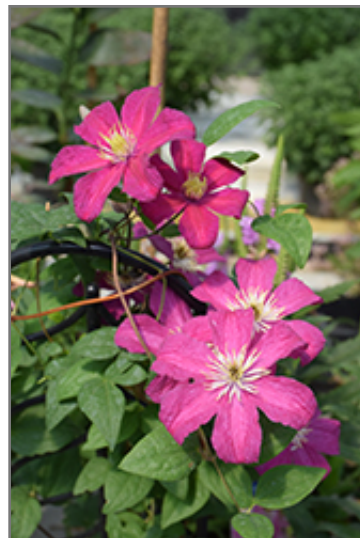
Barbara Harrington Clematis flowers Photo courtesy of NetPS Plant Finder