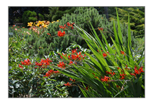
Lucifer Crocosmia in bloom

This is a relatively low maintenance plant, and should be cut back in late fall in preparation for winter. It is a good choice for attracting bees, butterflies and hummingbirds to your yard, but is not particularly attractive to deer who tend to leave it alone in favor of tastier treats. It has no significant negative characteristics.