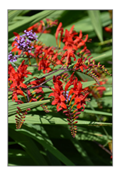
Lucifer Crocosmia flowers

Lucifer Crocosmia is an herbaceous perennial with an upright spreading habit of growth. Its medium texture blends into the garden, but can always be balanced by a couple of finer or coarser plants for an effective composition.