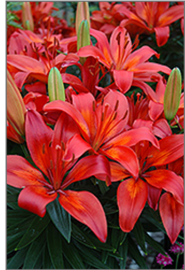
Matrix Lily flowers