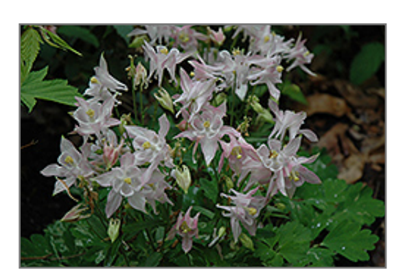
Biedermeier Pink Columbine flowers