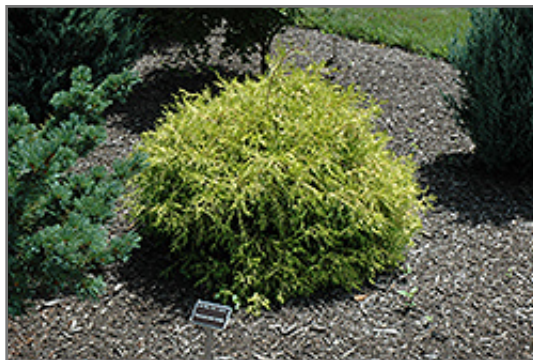
Golden Mop Falsecypress

This shrub does best in full sun to partial shade. It prefers to grow in average to moist conditions, and shouldn't be allowed to dry out. It is not particular as to soil type, but has a definite preference for acidic soils. It is highly tolerant of urban pollution and will even thrive in inner city environments. Consider applying a thick mulch around the root zone in winter to protect it in exposed locations or colder microclimates. This is a selected variety of a species not originally from North America.