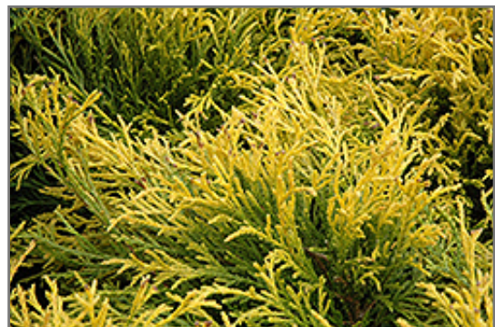
Golden Mop Falsecypress foliage