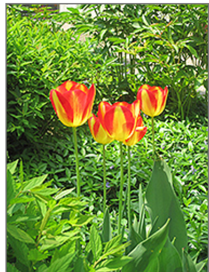
Antoinette Tulip in bloom